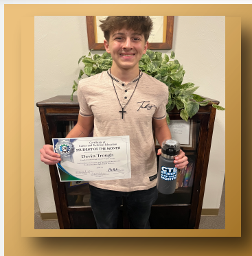
Devin Trough Estrella Foothills